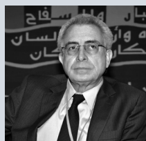
Ernesto Zedillo ( chair )